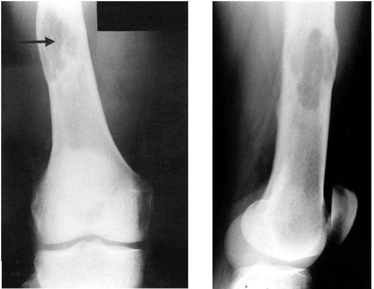
Fig. 1. Plain radiographs of the lesion in the femur (IA antero-posterior view; IB lateral view).

performed. The patient remained disease free for 3 years, but subsequently developed metastases that led to his death 6 years from the time of initial presentation.