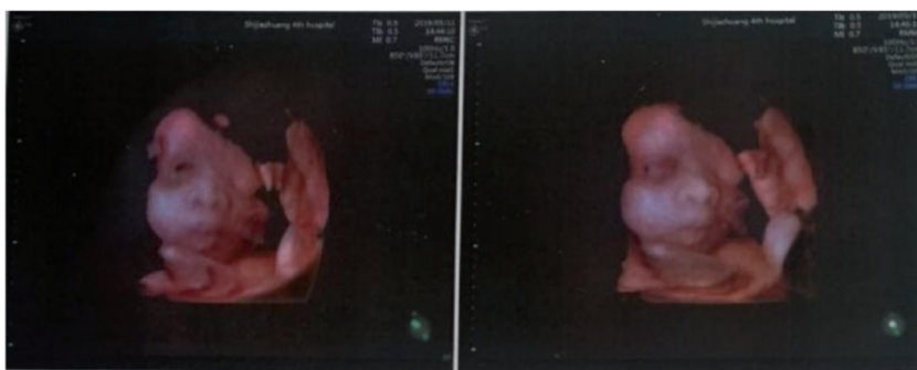
Figure 1. Color Doppler ultrasound examination showed that the pregnancy was intrauterine, fetal development was equivalent to full-term pregnancy, placental maturity was grade 2, and fetal umbilical cord was possibly wrapped around the neck.

full of what appeared to be thickened and elongated round ligaments of the uterus and ovarian oviduct (these were subsequently proven to be the right appendages), which were located to the left of the center of the incision (Figure 2(a)). The lower segment of the uterus contained a rich vascular plexus, and the bladder reflex of the uterine peritoneum could not be identified. In the process of avoiding the vascular-rich areas, a transverse incision of the lower uterine