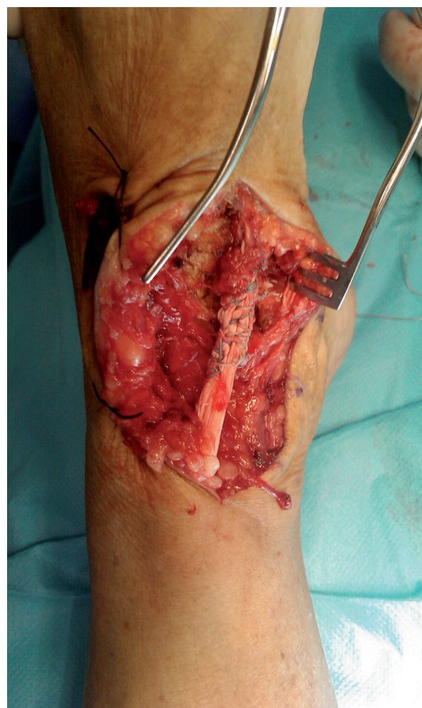
Fig. 2 - Reinserted tendon.