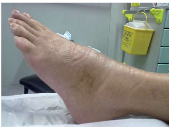
Figs. 3 and 4 - Postoperative period.