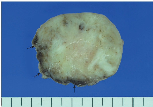
Fig. 1. The cut section of the abdominal tumor reveals a grayish-white solid mass with partially irregular edges (arrows).

Herein, we report an unusual occurrence of abdominal fibromatosis in a young child. The abdominal wall is a very unusual site for childhood fibromatosis. To date, the exact incidence of abdominal fibromatosis in children is unknown. We carefully searched the Internet for childhood fibromatosis and reviewed 285 cases of fibromatoses in patients younger than 21 years reported in the English literature (Table 1). Based on our review of childhood fibromatosis, the limbs (45.1%) were the most common site followed by the head and neck (28.5%) and trunk (24.7%). Among cases of trunk fibromatosis, only seven (2.4%) occurred in the abdominal wall when we excluded cases with no record of the detailed location in the trunk. Clinicopathologic and follow-up information were available in seven of eight cases including our present case, and are summarized in Table 2.