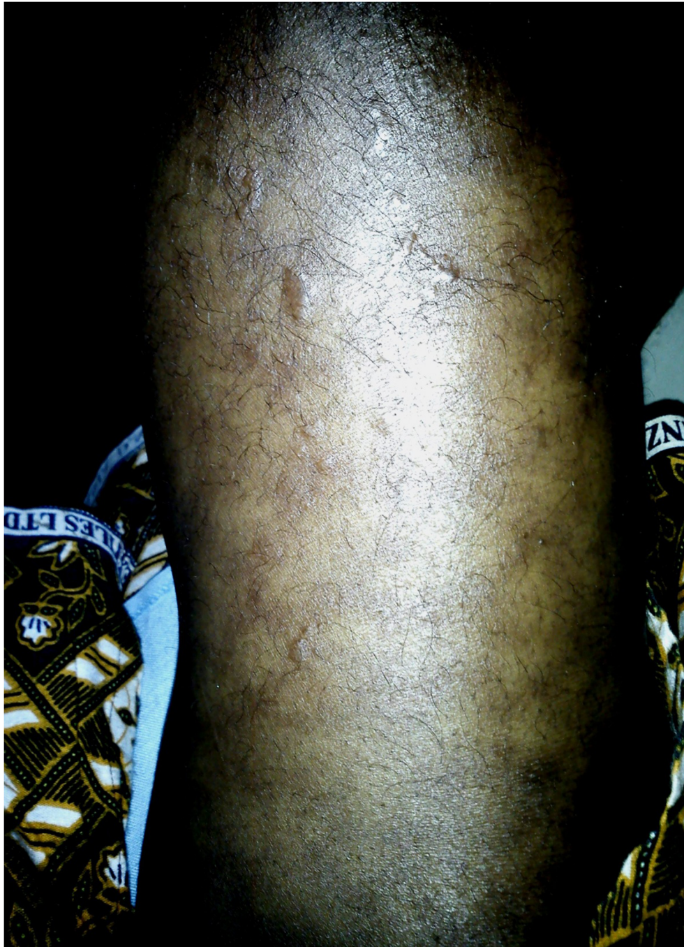
Figure 3 Photograph of proximal left lower extremity at five-month follow up visit. Legend: appearance of diffuse reticular rash consistent with livedo reticularis.

differentials in the absence of appropriate clinical and laboratory evidence.