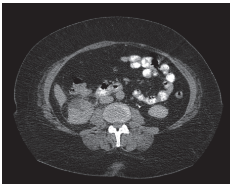
FIGURE 4: CT demonstrating no signs of contrast leakage from duodenum.