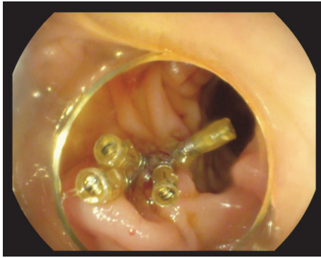
FIGURE 3: The pigtail drain has been removed and the wall defect has been stapled.