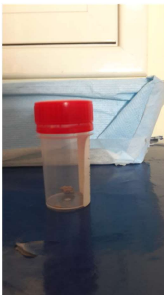
Figure 1. A sample of what the patient referred to as his urinary stones.

One day after discharge, symptoms of renal colic occurred, and he was admitted to our hospital. Physical examination did not reveal significant abnormalities. Only some small scars were noted on the mucous side of the prepuce. When asked, the boy could not provide an answer regarding the origin of these scars and how long they were present. All the laboratory tests already performed, including urinalysis, were repeated. In the repeated analysis, no abnormal results were observed. In particular, no blood was detected, whereas Mg, Ca, P, oxalate, citrate, sulfate and ammonia excretion levels were in the normal range. Radiopaque concretions were not noted in direct abdomen radiography. Ultrasonography was negative for calculi, and the previously observed slight pielectasia in the left renal pelvis was confirmed. The bladder was distended without appreciable endoluminal images. Despite these findings, on the morning of the second day of hospitalization, the boy indicated he expelled multiple stones from the urinary tract during the night. The stones were greyish-whitish with irregular margins and seven to eight millimetres in diameter (Figure 1). Laboratory evaluation revealed that the examined stone material was not related to lithiasis of the urinary tract.