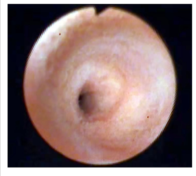
FIGURE 4 | Observe the contraction of the duodenal sphincter.

with a mean duration of 32.5 \pm 18.6 months (12–60 months). Biliary duct ultrasound and MRCP during the follow-up showed no bile duct stenosis or residual stones.