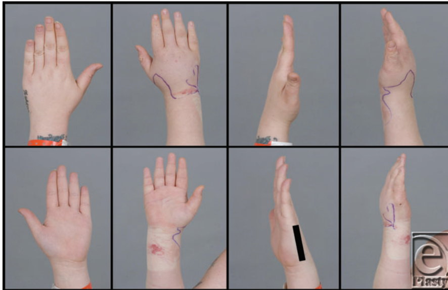
Figure 1. Clinical comparison of the right swollen hand versus the left unaffected hand.

Keywords: hand, swelling, lymphedema, lymphoscintigraphy, lymphoscintigram