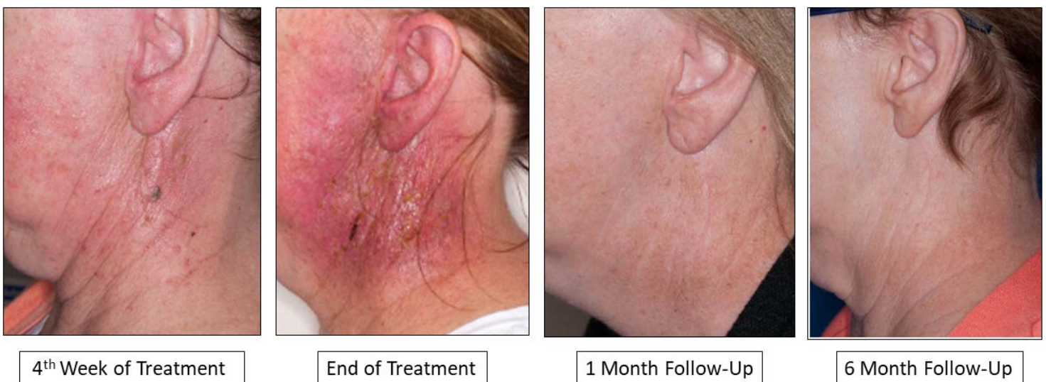
Figure 3. Clinically significant dermatitis and medical photography evaluation. An example is presented of a patient in the study who developed clinically significant dermatitis, which was documented with medical photography during and after treatment. Grade 3 dermatitis, defined per the Common Terminology Criteria for Adverse Events (CTCAEv4), included moist desquamation in areas outside of the skin folds as well as the possibility of bleeding secondary to minor abrasions or trauma. In our study, 93% of patients (n=67) developed grade \geq 2 dermatitis, whereas 21% (n = 15) developed grade 3 dermatitis.

optimization, a further benefit with IMPT may come in the form of optimizing plans based on linear energy transfer and RBE, which, by altering beamlet intensity (increasing the weighting of low-energy beams), the linear energy transfer can be elevated within a target and still maintain the same physical dose [9, 21]. That would be ideal for SGCs, given the propensity for certain histologic subtypes (ie, adenoid cystic carcinoma) to harbor resistant cancer stem cells and may further improve the therapeutic index of PBT [22].