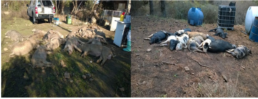
FIGURE 1 Picture of illegal free-ranging pigs culled during eradication activities