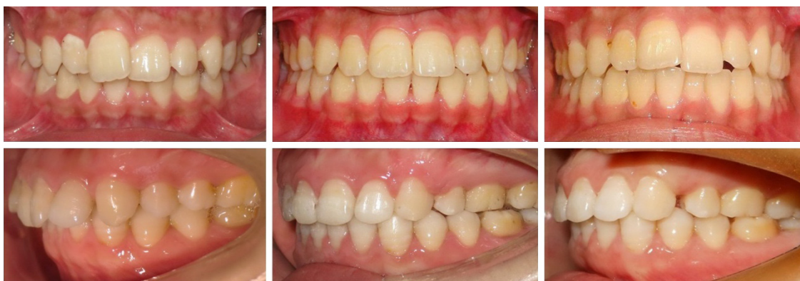
Figure 2 Images shown to patients and parents.

A questionnaire (Figure 3), with a cover letter explaining the purpose of the study, was used to identify how long retainers were worn in the 2 weeks before first revisit and any reasons for not wearing the retainers as instructed. The list of reasons was compiled from interviews with 50 patients who previously wore retainers, and was approved by three professors of orthodontics. After the patient completed the questionnaire, we checked the accuracy of the wear time response by communicating with the parents living with the patient. SPSS software (version 17, SPSS, Chicago, IL, USA) was used to calculate frequencies and percentages and to run one-way analysis of variance (ANOVA) to detect differences in compliance among the three groups. The significance level ( \alpha ) for ANOVA was set at P < 0.05 .