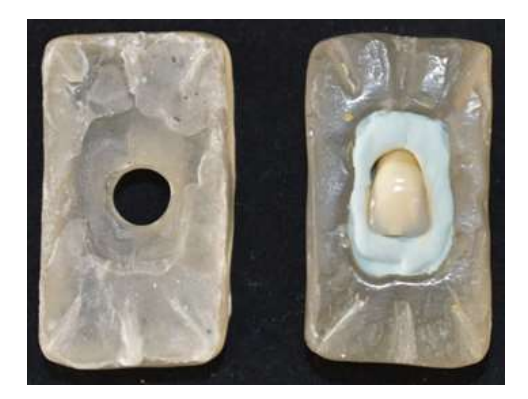
Fig. 1: Transparent acrylic resin mold with a tooth positioned in the central part in silicone material

The solutions were refreshed every 3 days and stirred to prevent deposition of particles [12]. A portable spectrophotometer (VITA Easy shade; Compact, Vita Zahnfabrik, Bad Sachingen, Germany) was used to measure the CIE L*a*b* color parameters of the teeth. The initial color of each tooth was measured prior to immersion in the solutions. The immersed specimens were kept in an incubator at 37°C for subsequent measurements at time intervals of 24 h ( \Delta E12), 1 week ( \Delta E13), 2 weeks ( \Delta E14), and 4 weeks ( \Delta E15). The teeth were rinsed with distilled water before each measurement. The device was calibrated prior to each measurement, and the measurements were made three times for each tooth. The mean values were considered as the final value [14,15].