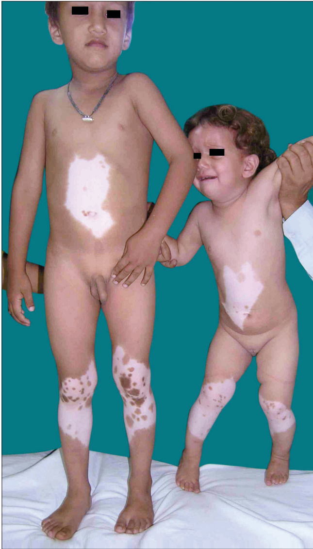
Figure 1: Depigmentation on the trunk and mid-portion of lower extremities in two siblings. Note the islands of hyperpigmented macules within depigmentation