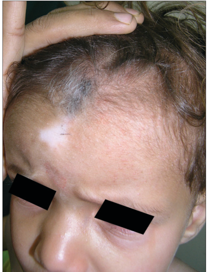
Figure 2: White forelock and depigmented macule on mid-forehead. Also note the whitening of hair of the medial one-third of eyebrows