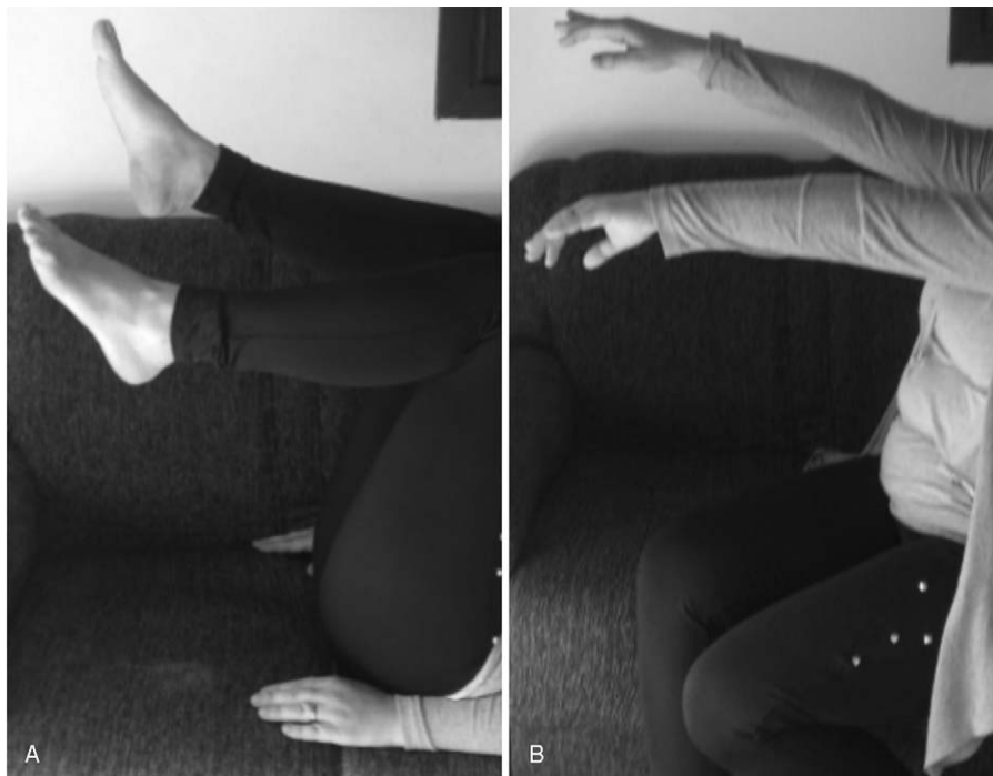
Figure 3. Mingazzini test on lower (A) and upper (B) limbs revealing evident asymmetry between right and left limbs even after recovery.

Our patient fulfilled all diagnostic criteria: clinical (worsening of symptoms throughout the day, in the presence of inflammatory interurrences, and with significant improvement with acetylcholinesterase inhibitors), laboratory (presence of high levels of anti-AChR), and electroneuromyographic (decreased amplitude