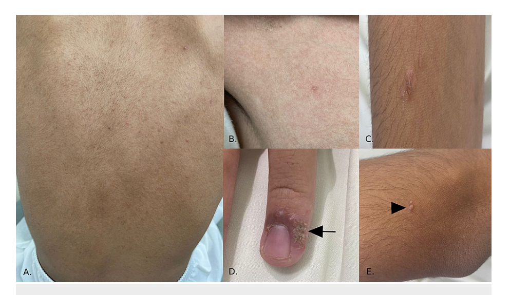
FIGURE 2: Acral eruption progressed into generalized erythematousviolaceous smooth papulovesicular lesions

(A) Over the back, there are fine and small scattered erythematous-violaceous vesicles and pustules. (B) Over the right upper quadrant of the chest, there is a solitary erythematous vesicle. (C) Over the lateral aspect of the right arm, there is a solitary raised erythematous plaque with fine scales. (D) Over the periungual area of the left fourth digit, there is an erythematous-violaceous plaque with yellowish crustation (see arrow). (E) Over the extensor surface of the left forearm, there are grouped scaly erythematous papulovesicular lesions with fine scales (see arrowhead).