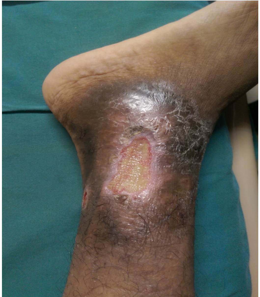
FIGURE 1: Leg ulcer (non healing)

Examination findings were as follows: pallor, hepato-splenomegaly, no lymphadenopathy. There were short systolic flow murmurs heard along the left sternal edge. In the lower limbs, the right leg showed a healed ulcer on the lateral malleolus. On the left leg, there was an approximately 10 cm elongated ulcer with undermined edges and pus at the base, along with surrounding skin excoriations and lichenification (Figure 1).