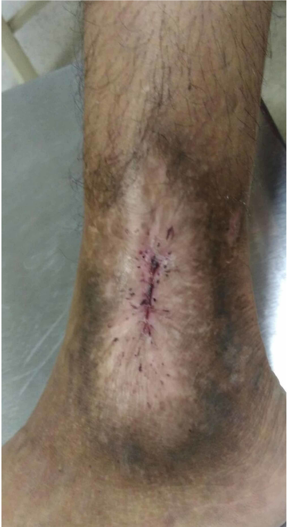
FIGURE 2: Healed leg ulcer