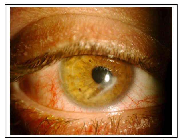
Fig.1: Paracentral corneal scar in the right eye of the Case 1 due to corneal penetrating injury.

Seven eyes of 4 patients with keratoconus or traumatic keratopathy treated with Toris-K contact lenses (SwissLens SA, Prilly, Switzerland) were enrolled in to this study. Each patient underwent a detailed clinical evaluation that included recording