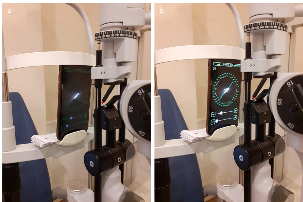
Figure 1. (a) Angle of slit as seen on the screen of a smart phone, (b) Angle of slit seen on a smart phone as measured with the Axis Assistant smartphone application (Centro Oftalmico Varas Samaniego, Guayaquil, Ecuador).

In the Callisto eye group, a reference image was taken with the IOLMaster 700 and the data were transferred to the Callisto eye image-guided system, which was already connected to an Opmi Lumera 700 surgical microscope (Carl Zeiss, Oberkochen, Germany). Live-stream images from the