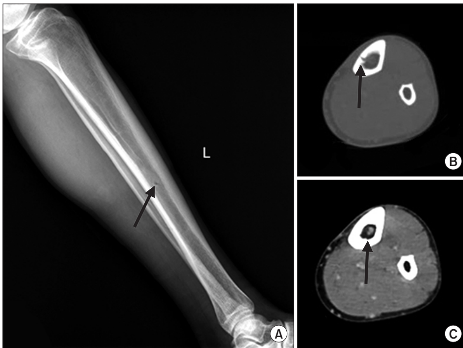
Fig. 2. (A) Simple radiography revealed a cortical bone defect in the tibia (arrow). (B, C) Computed tomography showed a tibial opening and an intraosseous vascular cluster (arrow).