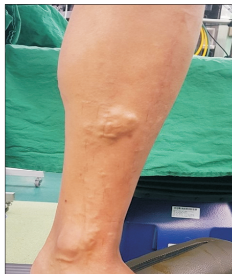
Fig. 1. Localized ping-pong ball-sized varix in the left pretibial area.

The patient returned several days after the operation for a further evaluation. Radiographs of the left leg showed a focal defect on the tibia (Fig. 2A). Computed tomography (CT) revealed that the intraosseous vein was communicating with the superficial vein through a 3-mm tibial opening (Fig. 2B, C). Additionally, the intraosseous vein origi-