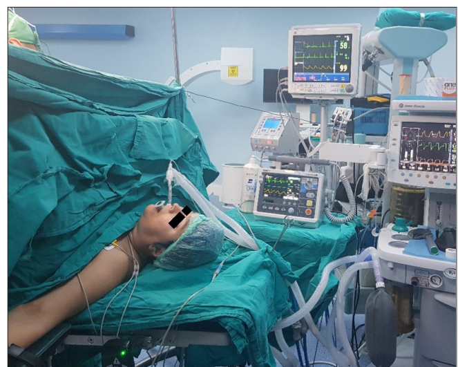
Figure 3. The defibrillator was ready for use during the procedure