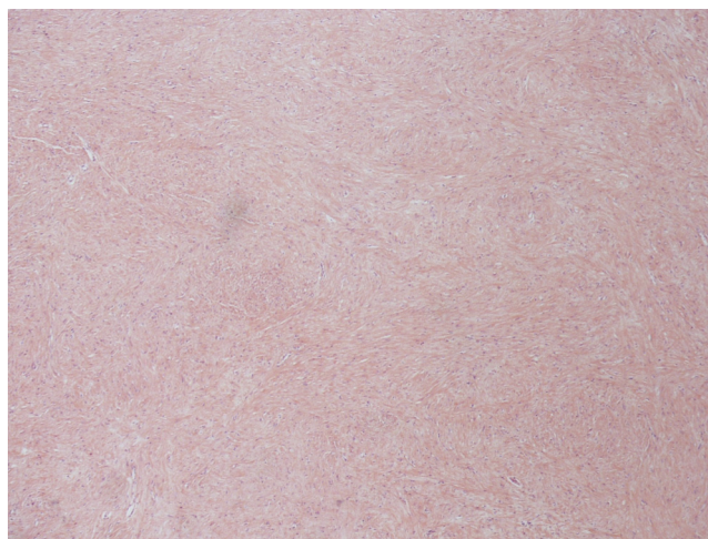
Fig. 2. Histopathologic image of the oesophageal gastrointestinal stromal tumor (GIST). H & E stain.