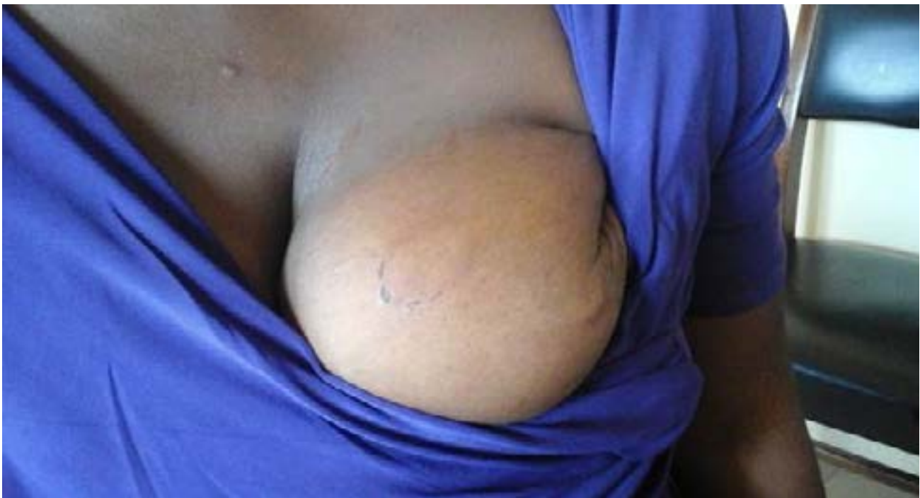
Fig. 2 Contusion of the breast

were laceration (31.0%) and abrasion (9.5%) shown in Fig. 3 (Abrasion and Laceration of the breast) and Fig. 4 Abrasion of the thigh.