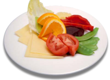
Figure 2. An example of a food image containing five food categories: cheese, tomato, oranges, beans, and carrots.