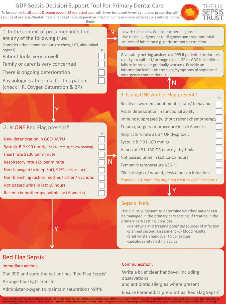
Fig. 3 GDP sepsis decision support tool for primary dental care should be applied to all adults and young people aged 12 years and over with fever (or recent fever), symptoms presenting with a source of orofacial/dental infection (including post-operative infection) or have clinical observations outside normal limits, reproduced with kind permission from the UK Sepsis Trust 5

system will prevent or fight infection (bacteria, viruses, fungi). However, the immune system can sometimes go into overdrive, resulting in vital organs and other tissues being targeted. This can result from any injury or infection in