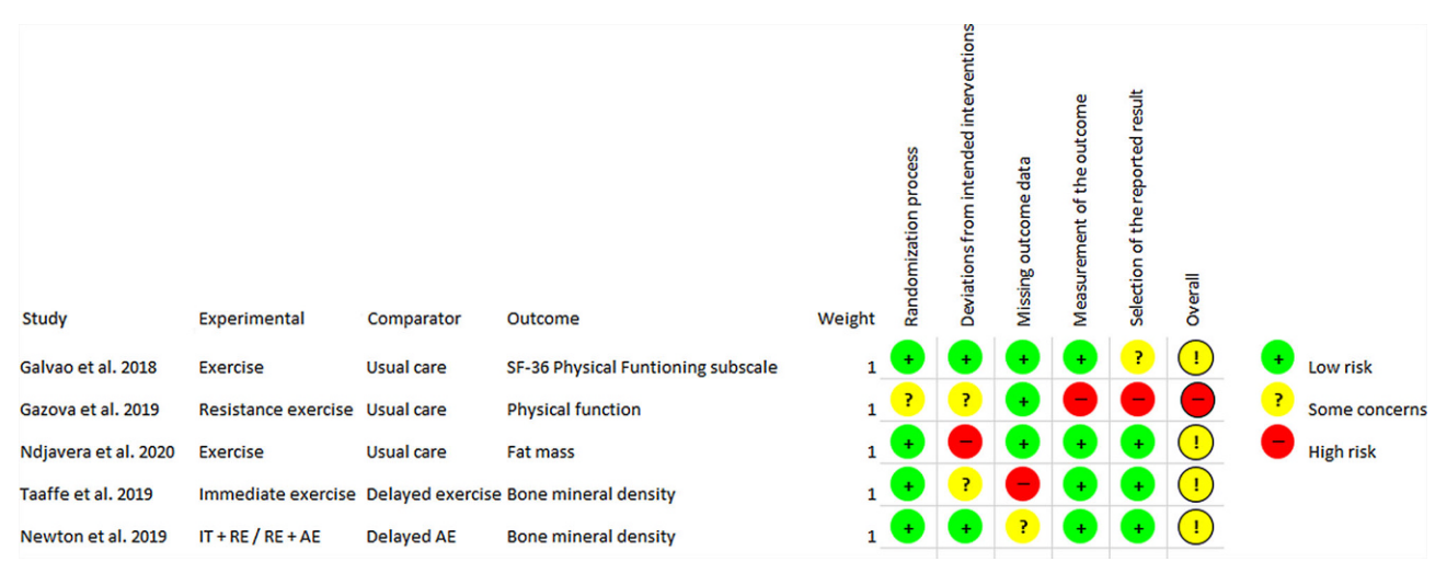
Fig. 3 Risk of bias analysis, per protocol aspect. RE resistance exercise, AE aerobic exercise, IT impact training

Fig. 2 Risk of bias analysis, intention-to-treat aspect. RE resistance exercise, AE aerobic exercise, IT impact training