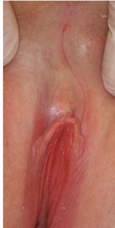
Fig. 4 A 17-year-old woman with lichen sclerosus affecting primarily the periclitoral region: the periclitoral hood is sealed and the clitoris buried. Fissure in the upper part of the periclitoral hood and diffuse erythema of the vestibule

by Simpkin and Oakley [57] in their clinical review of 202 affected women. Labia minora was affected in 87 % of women, perineum in 85 %, clitoris in 72 %, and the perianal region in 50 %. LS can koebnerize and may first arise in an episiotomy scar. Extragenital lesions are seen more frequently in women than men, and occurred in 11 % of the 327 female patients examined by Cooper et al. [55], in 13 % of the 357 female patients examined by Meyrick Thomas et al. [58], and in 13 % of the women reviewed by Simpkin and Oakley [57].