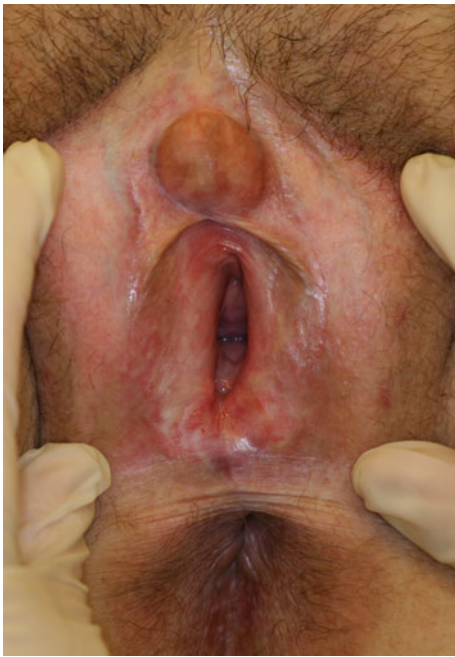
Fig. 6 A 47-year-old woman with vulvar lichen sclerosus: diffuse pallor, erythema, sclerosis, and telangiectasias, almost complete loss of labia minora and smegmatic pseudocyst resulting from adhesions of the clitoral hood

(Fig. 4). Smegmatic pseudocyst can result from adhesions of the clitoral hood (Fig. 6) [54]. Fusions of tissue may occur across the midline, rarely leading to problems with micturition. Severe introital narrowing interfering with intercourse may rarely occur, but is seen more frequently in the LS/LP overlap syndrome (Fig. 7) [5].