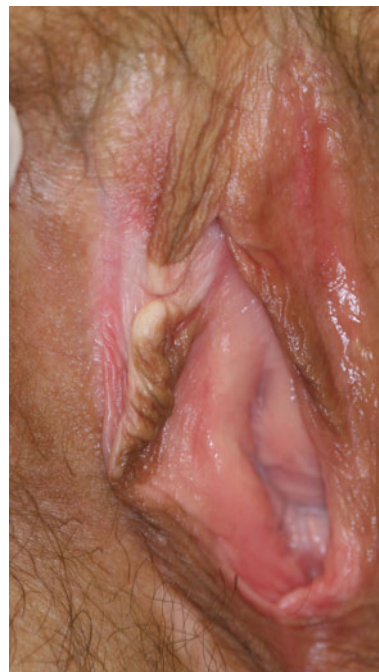
Fig. 1 A 41-year-old woman with asymmetric vulvar lichen sclerosus limited to the upper part of the right labium minus and the interlabial sulcus: depigmentation, hyperpigmentation, and sclerosis leading to circumscribed retraction of the right labium minus

The area involved may vary from a small, single area (Fig. 1) to the entire region of vulva, perineum, and perianus. There may be extension to the genitocrural folds, buttocks, and thighs (Fig. 2). The characteristic sites involved are the interlabial sulci, labia minora and labia majora, clitoris and clitoral hood, and perineum and perianal area, giving rise to the characteristic 'figure-of-eight' shape (Fig. 3). Genital mucosal involvement does not occur, the vagina and cervix always being spared, in contrast to LP [5]. A retrospective chart review of 81 consecutive patients with LS showed that almost all of the affected women had labial involvement, with concomitant involvement of the clitoris (70 %), perineum (68 %), and perianal region (32 %) [56]. Similar results were obtained