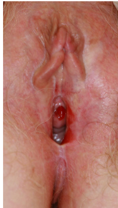
Fig. 7 A 75-year-old woman with lichen sclerosus/lichen planus overlap syndrome: diffuse pallor, erythema, sclerosis, and telangiectasias. Damage of the normal architecture with partial loss of labia minora. Edema of the clitoris and the residual labia minora. Introital erosions and narrowing of the introitus. Sagittal fissuring of the perineum. Coincidental finding is an urethral caruncle

Vulvar melanosis can result from chronic disease. Genital lentiginosis frequently presents with dark brown-black macules with variegated pigmentation and irregular borders. Genital nevi occasionally exhibit similar characteristics particularly in the context of chronic inflammation and LS. Histologic examination can easily differentiate mucosal lentiginosis from melanoma, but melanocytic nevi superimposed on a background of anogenital LS, both clinically and histologically, may mimic malignant melanoma [59]. Clark et al. [60] reported that more than one-third of genital nevi sent to them in consultation (20/56) had previously been misdiagnosed as melanoma. Histologic interpretation is particularly difficult in the setting of LS, when papillary dermal melanocytes entrapped in sclerosis often display cytologic atypia and the lymphocytic infiltrates can disrupt dermal nests. Carlson et al. [61] identified ten melanocytic lesions clinically suspected to be malignant melanoma or atypical melanocytic nevi arising in anogenital LS of the vulva and perineum. The suggestive clinical symptoms or signs were irregular borders, black clinical appearance, recent growth, and/or recent onset of pruritus. Melanocytic proliferations arising in LS were