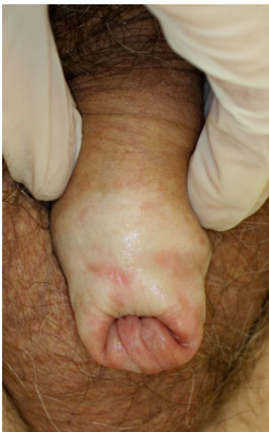
Fig. 11 A 65-year-old man with genital lichen sclerosus: depigmentation, macular erythema, and severe sclerosis leading to phimosis