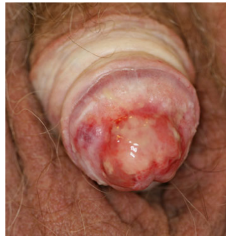
Fig. 13 A 73-year-old man with genital lichen sclerosus: severe sclerosis, scarring of the coronal sulcus, and large ulceration of the glans