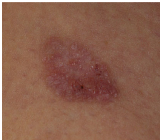
Fig. 15 An 81-year-old woman with genital and extragenital lichen sclerosus on the upper thighs: papular, partially atrophic lesion with wrinkled surface, telangiectasias, and hemorrhage