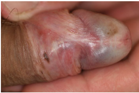
Fig. 10 A 37-year-old man with genital lichen sclerosus: grayish-bluish, white discoloration of the glans and inner surface of the prepuce, sclerosis of the frenulum, and freckled melanosis

Early manifestations are greyish or bluish-white discolorations of the glans and/or the inner surface of the prepuce (Fig. 10), sometimes with considerable telangiectasia. Itch may be present. Subsequently, skin thins, sclerotic plaques appear, and the prepuce becomes tightened and nonretractile. Phimosis with the risk of paraphimosis develops (Fig. 11). One report documents that 14 % of primary (congenital) phimosis occurring in young adults and 40 % of secondary (acquired) phimosis in older patients were due to progressive LS [65]. The involved inelastic skin is prone to fissuring during sexual activity. Purpura, bullae, erosions, and ulcerations may be encountered (Figs. 12, 13). Fifty-five percent of affected men report sexual symptoms as painful erections and erectile dysfunction [33]. Eighteen percent report urologic symptoms such as dysuria, narrowing of the urinary stream, and poor urinary flow. Twenty-nine percent are asymptomatic [33].