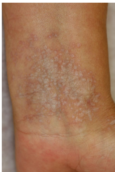
Fig. 14 A 65-year-old woman (same patient as in Fig. 3) with genital and extragenital lichen sclerosus on the volar aspects of the wrists: characteristic bluish-white, polygonal, slightly elevated papules coalescing into plaques

lesions are prone to koebnerization and may express themselves in areas of physical trauma, continuous pressure, and scarring. Lesions begin as polygonal, bluish-white, slightly elevated papules (Fig. 14). Papules coalesce into plaques, which with time become increasingly atrophic and get a wrinkled surface (Fig. 15). Telangiectasias and follicular plugging may become prominent (Fig. 16). The fragility of the flattened epidermal-dermal interface may give rise to bullous and hemorrhagic lesions. Extragenital LS is much less symptomatic than genital LS, underlining the role of occlusion and maceration in the etiology of pruritus, soreness, and pain in genital LS.