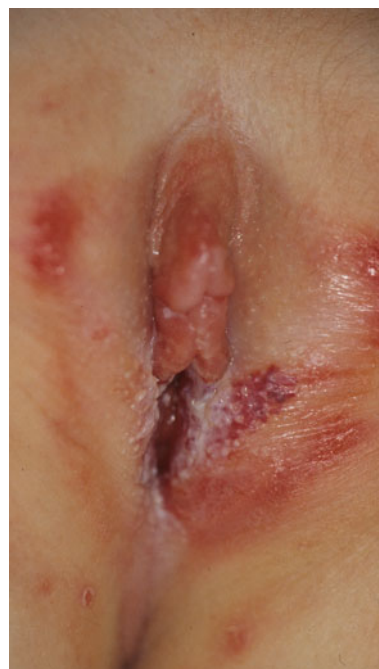
Fig. 9 A 6-year-old girl with anogenital lichen sclerosis: slight sclerosis of the clitoral hood and the inner aspect of labia majora. Prominent contusiform hemorrhage

LS may improve symptomatically but usually does not entirely resolve at puberty. A retrospective study of 21 postpubertal girls with LS presenting prepubertally revealed that the disorder appeared less active in most