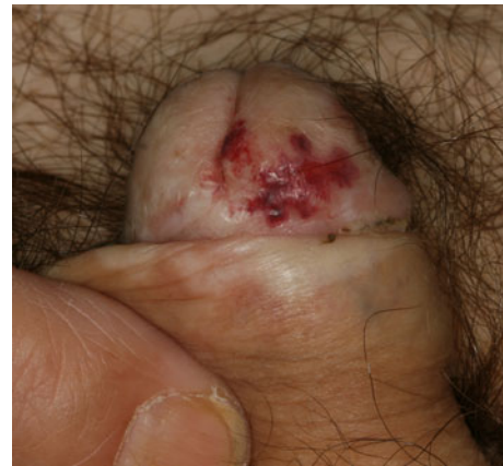
Fig. 12 A 57-year-old man with genital lichen sclerosus: depigmentation, atrophy of the glans with crinkling appearance, ecchymoses, and macular melanosis