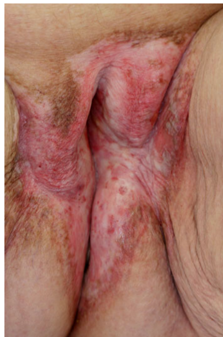
Fig. 2 An 80-year-old woman with extensive, long-standing, anogenital lichen sclerosus affecting the entire vulva, perineum, perianal region, genitocrural folds, inner thighs, and buttocks: depigmentation, hyperpigmentation, erythema, sclerosis, erosions, telangiectasias, and complete loss of labia minora