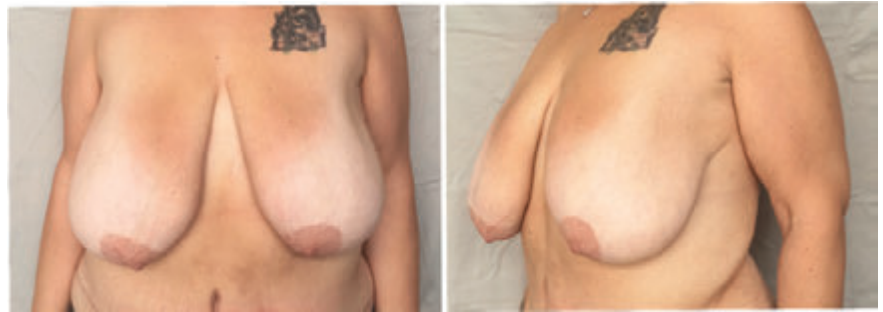
Figure 1. Frontal and lateral preoperative view.

pathergy of the disease. The surgical management of active PPG ulcers is discouraged due to the risk of pathergy-associated worsening. 6,10 Early diagnosis and a correct therapy are the keystones to reduce the need