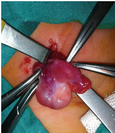
FIGURE 3: This intraoperative photo well demonstrates the right ovary and the fallopian tube in the hernial sac.