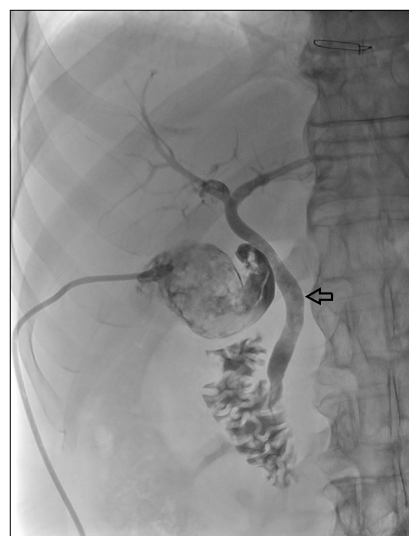
Fig. 2. Endoscopic retrograde cholangiographic findings of hemobilia. The common bile duct is dilated and a filling defect is present (arrow) when contrast media is injected through the percutaneous transhepatic gallbladder drainage tube, suggesting a blood clot in the bile duct.

Hemobilia is a hemorrhage into the biliary tract [1]. The term hemobilia was coined by Sandblom in 1948 to describe hemorrhage into the biliary tract as a result of a communication or fistula between the biliary tract and the arteriovenous circulation [2]. Hemobilia is not a common complication, but