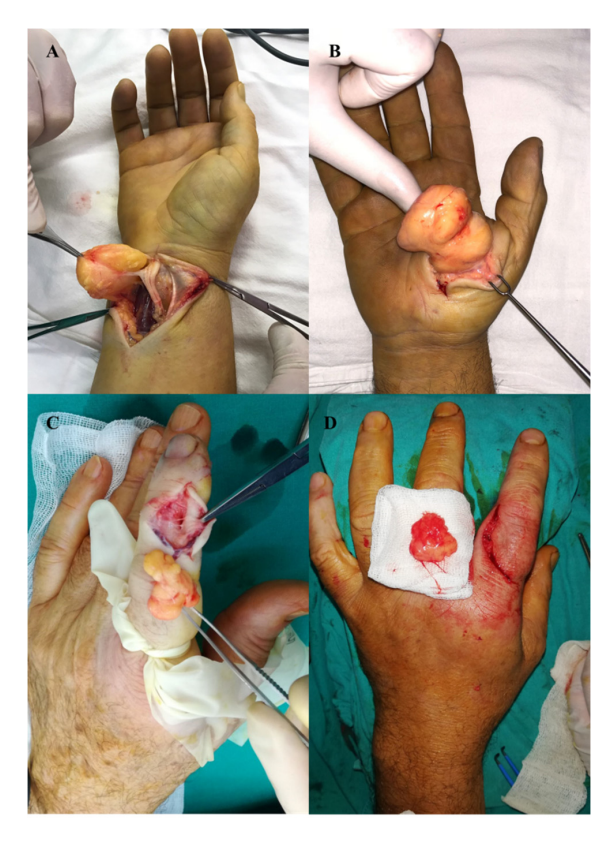
Figure 5. Intraoperative aspects of lipoma excision: ( A ) wrist, ( B ) thenar eminence, and ( C ) dorsal face of the index finger with removed specimen ( D ).

Complete lipoma excision was performed in all cases, these being well-encapsulated (Figure 5).