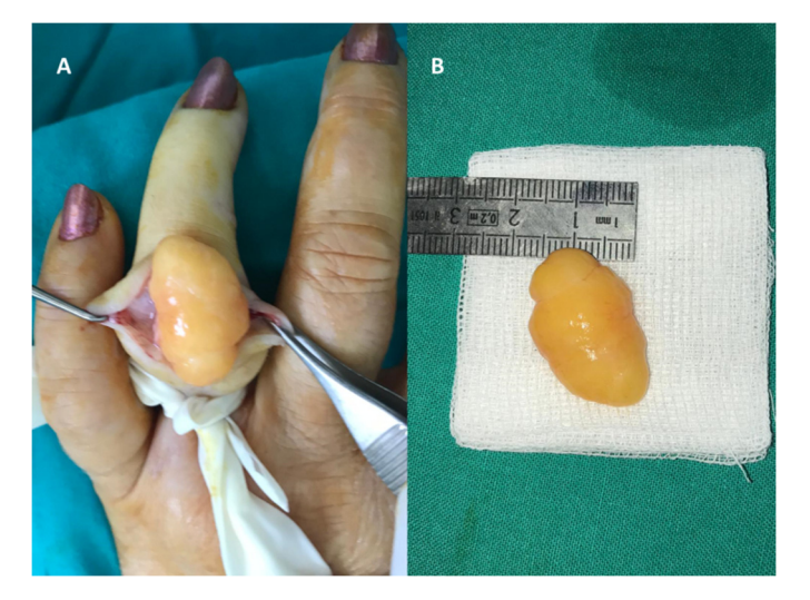
Figure 6. Large 4th finger lipoma measuring 3.7/1.7 cm: (A) intraoperative aspect and (B) removed specimen.

The largest finger lipoma was the one located on the dorsal aspect of the fourth finger, measuring 3.5/1.7 cm (Figure 6).