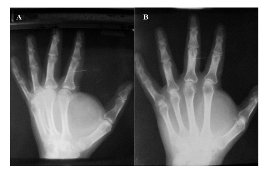
Figure 3. Lipoma in the hipothenar eminence—radiological aspect (A,B).

The Posch sign was positive in all cases. Improving the aesthetic appearance of the hand and fingers was invoked by the patients, in all cases. Radiological examination revealed the absence of skeletal changes and transparency of the soft-tissue tumor mass at different locations (Figure 3).