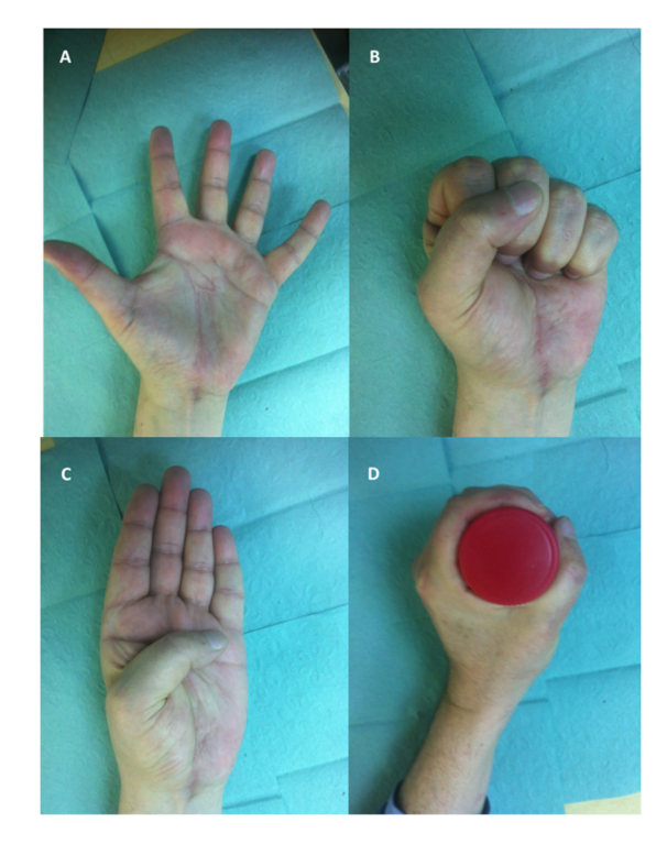
Figure 8. Functional and aesthetic outcomes after giant midpalmar lipoma excision and reconstruction of the 5th deep flexor: ( A ) flexion, ( B ) extension, ( C ) Kapandji score of 10, and ( D ) power grip.

no immediate or remote complications in any of the cases. In all cases, removal of sutures was performed 14 days postoperatively. Postoperative occupational therapy was indicated for the patient with deep finger flexor reconstruction. The outcomes were good with full socio-professional reintegration of patients, who reported high satisfaction levels (Figure 8).