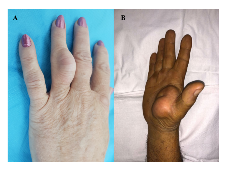
Figure 1. Clinical aspect of the lipoma: (A) ring finger localization, (B) thenar eminence localization.

The history of the disease ranged from 1 to 7 years. No patient had a history of trauma. Hypercholesterolemia was not reported in any of the patients. On palpation, a relatively mobile tumor mass with a soft consistency was detected in cases with wrist, thenar eminence, and finger location, whereas the tumor mass was fixed in cases with a midpalmar location. Hypoesthesia in the median nerve territory, without spontaneous or palpation-induced pain, was detected in three cases (11.1%) with wrist location. In the other cases, sensitivity was preserved and similar to that in the contralateral anatomical territory. Functional deficits were found in the cases of giant lipomas of the thenar eminence and those located in the midpalmar space, with a motor deficit in the execution of pinch movements, grasping, and mobility of the fingers. In one of the cases with a midpalmar