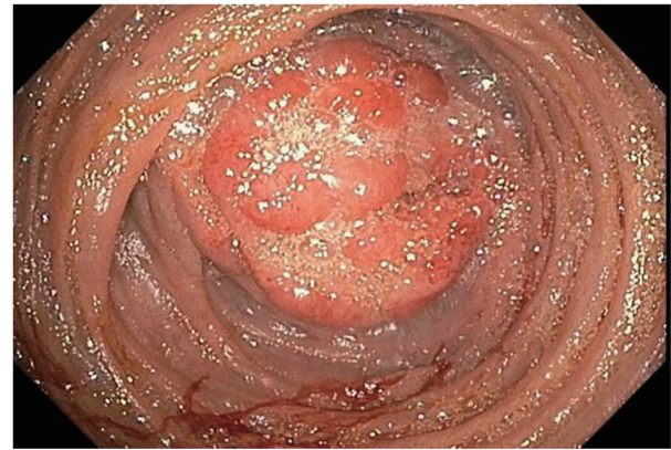
Figure 2. Near obstructing jejunal mass about 60 cm distally to the duodenal bulb.

Small intestinal tumors are uncommon, making up about 2.3% of all gastrointestinal malignancies in the United States [4]. Of these small intestinal malignancies, adenocarcinoma accounts for about 30-40% with the highest incidence found within the duodenum [2, 4]. The mean age at diagnosis is generally in the fifth decade of life with a male predominance [5, 6]. The