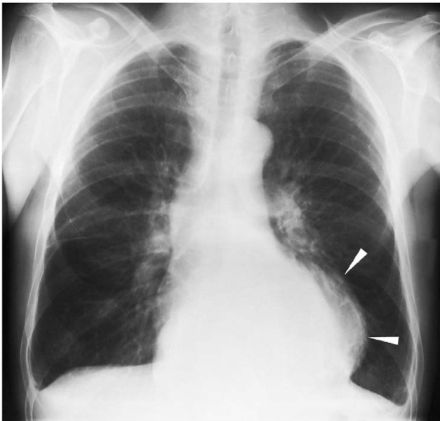
Figure 1 Chest X-ray on admission. Initial examination showed an intrathoracic mass overlying the left margin of the heart (arrowheads). No interstitial pulmonary edema was noted. Small pleural effusions are shown.