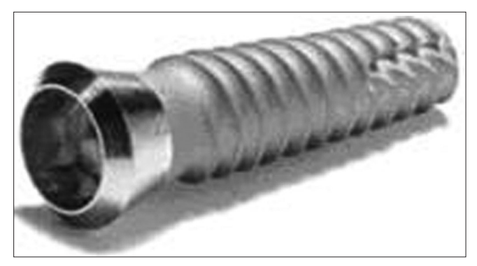
Figure 2: Swiss-pluss implant

hour before surgery. Local anesthesia was induced by infiltration of articaine/epinephrine and postsurgical analgesic treatment was performed with 100 mg Nimesulid, twice daily, for three days. Oral hygiene instructions were provided.