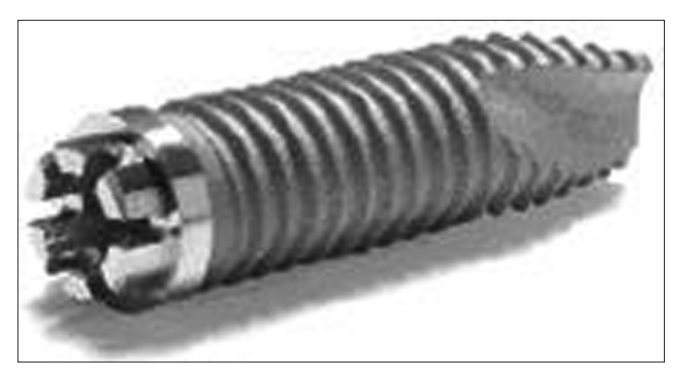
Figure 3: Spline implant

The difference between the implant abutment junction and the bone crestal level was defined as the Implant Abutment Junction (IAJ) and calculated at the time of operation and during follow-up. Delta IAJ was the difference between IAJ at the last check-up and IAJ recorded just after the operation. The delta IAJ medians were stratified according to the variables of interest.