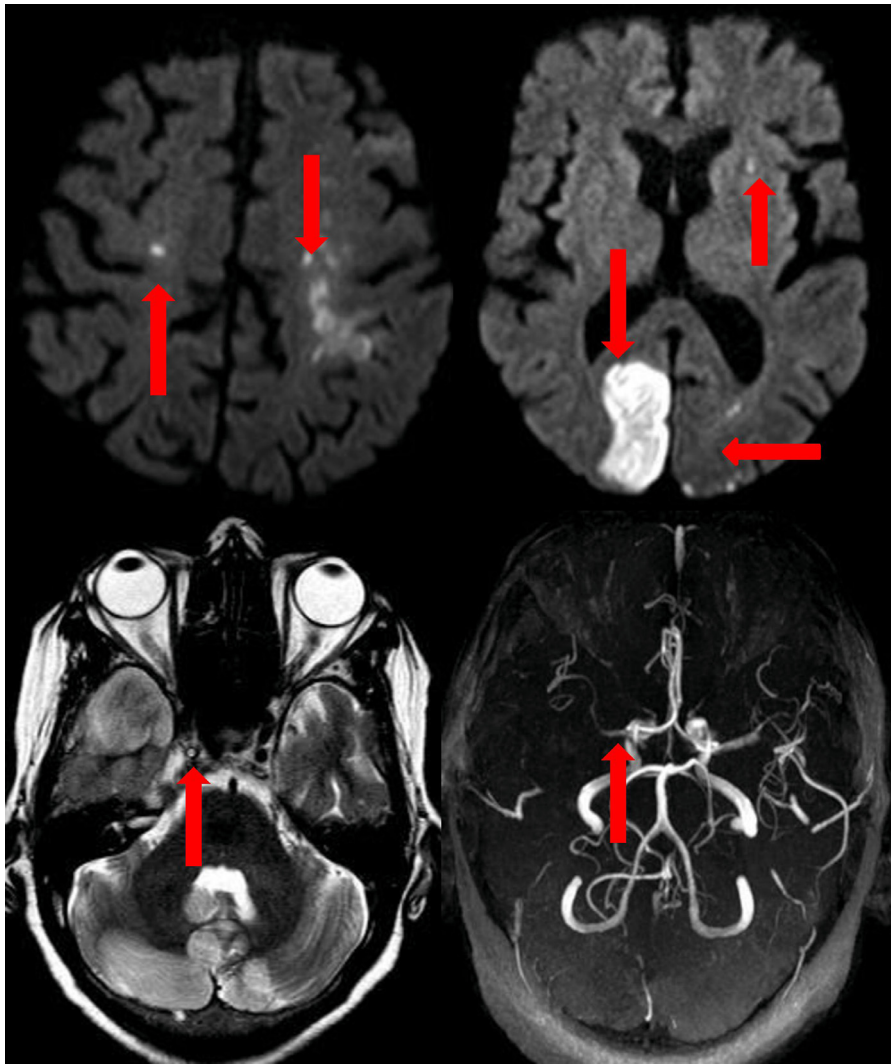
Fig. 3. Representative brain images (Clockwise from left top corner: 3a bilateral anterior circulation infarcts, 3b) bilateral posterior circulation and left anterior circulation.