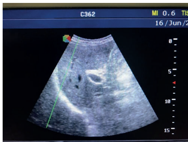
Figure 1. Right diaphragm visualization by B-mode ultrasound. The diaphragm is seen as a thick white line moving with respiration. The liver is used as an echogenic window.

Totally, 757 healthy subjects with normal spirometry were included in this study [478 men (63.14%) and 279 women (36.86%)]. The mean age of the study population was 45.17 \pm 14.84 years. Men were significantly older, had significantly higher FVC% and VT%, while women had significantly higher body mass index (BMI) and better FEF25-75% (Table 1). There was a statistically significant difference between right and left diaphragmatic excursion among all studied subjects (Table 2). The ratio of right to left diaphragmatic excursion during quiet breathing was (1.009 \pm 0.19) ; maximum 181% and minimum 28%. Only 19 cases showed a right to left ratio less than 50% (5 men and 14 women). Right diaphragm-