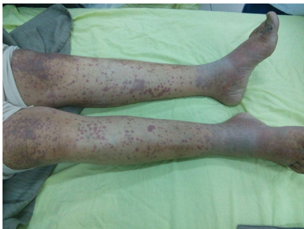
Figure 1 Bilateral purpuric lower limb skin lesions due to HCV-MC-induced vasculitis in one of the included patients.

Abbreviation: HCV-MC, hepatitis C virus mixed cryoglobulinemia.