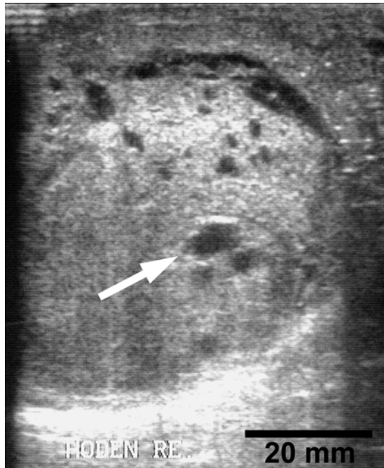
Figure 1 Ultrasonography, 8.0 MHz. Sagittal section of right testis showing areas of inhomogeneous parenchyma and cystic lesions (arrowhead).