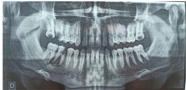
FIGURE 3 Panoramic radiograph revealed a deep carious lesion with exposed pulp on the tooth 46 and a large periapical radiolucency in relation with the two roots of 46

Computed tomography (CT) scan was indicated, and the axial slices confirmed the periapical lesion and showed a mixed radiolucent-radiopaque appearance of the lesion, located on the apices of the tooth 46. It also revealed a local perforation on the buccal alveolar table in front of the same tooth (Figure 4).