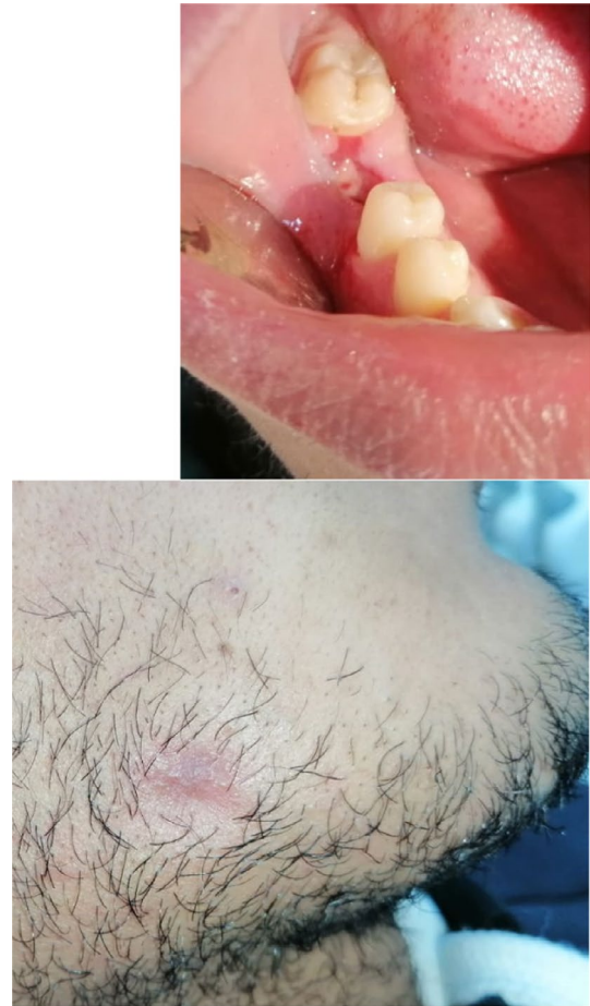
FIGURE 6 (A): Intraoral view, 1 month after, revealed the healing of the alveolar site. (B): 1 month later: Significant healing of the sinus tract

dermatologist or plastic surgeon should always refer patients to the dentists to eliminate a possible dental infection. 7