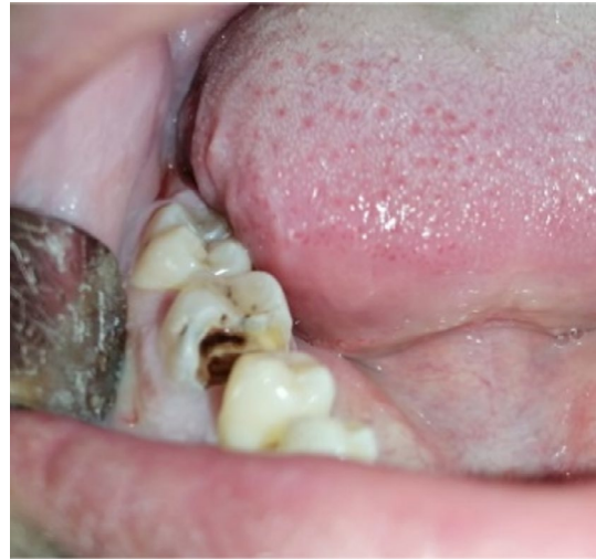
FIGURE 2 Intra oral view showing the presence of a deep carious lesion in the 46