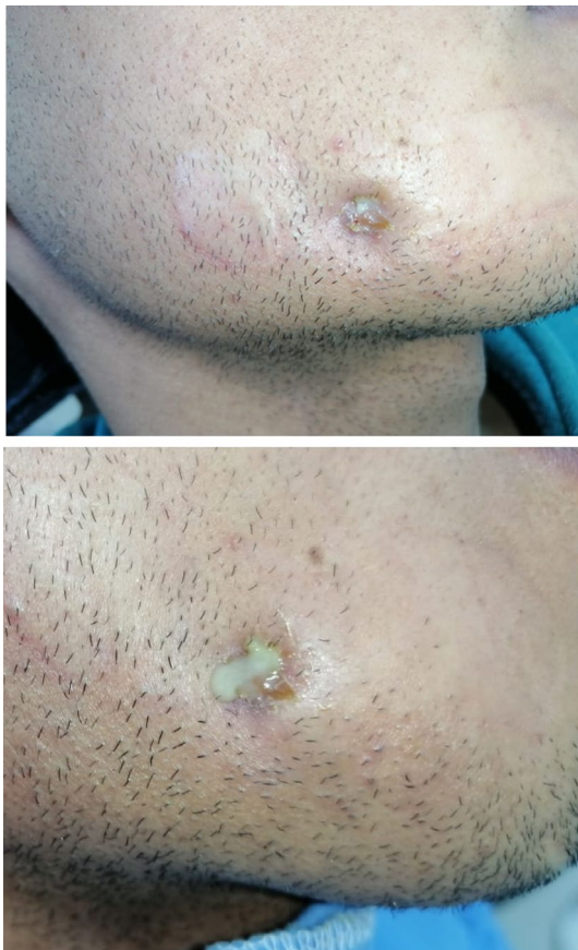
FIGURE 1 (A): Clinical view of the productive non-retractile cutaneous fistula in the right cheek. (B): Cutaneous sinus tract with depression aspect, accompanied by a purulent discharge in the cheek region

Panoramic radiograph revealed a large radiolucency of 2 cm diameter with a well-defined cortical border in relation with the roots of the tooth 46 (Figure 3). A radio-opaque lesion was also noticed in the same area and was associated with root resorption of the tooth 47.