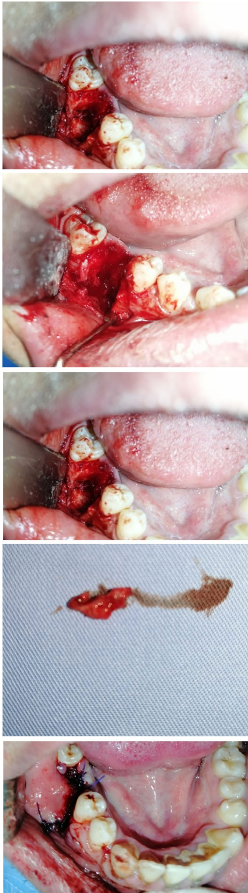
FIGURE 5 (A, B): Extraction of 46 and cyst enucleation. An area of bone loss was visible after elimination of the cord-like tract. (C): The cord-like tract was excised from its origin to the skin. (D): view of the isolated sinus tract. (E): The sutures