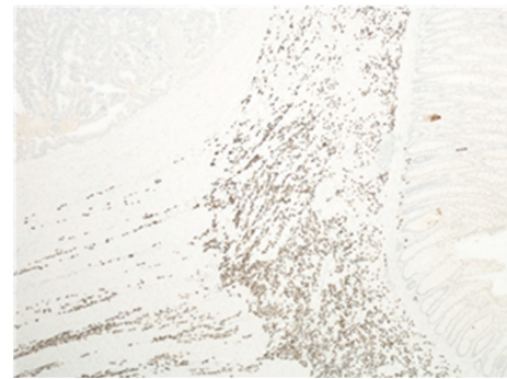
FIGURE 3: Immunohistochemical staining with CK 7 demonstrating negative adenocarcinoma uptake and positive metastatic carcinoma uptake.

The commonly described metastatic sites of lobular carcinoma of the breast vary from those of ductal carcinoma [6]. Lobular carcinoma more commonly metastasises to the uterus and appendages, gastrointestinal tract, and peritoneum [7, 8], whereas ductal carcinoma has a propensity to metastasise to the lungs, liver, and brain [8]. Although rarely detected clinically, a postmortem series has suggested that between 8 and 35% of breast cancers metastasised to the gastrointestinal tract [2, 7, 9]. The stomach and small intestine are more commonly involved in metastatic breast carcinoma than the colon or rectum, the latter two being only very rarely involved [8]. Gastrointestinal involvement of any type of breast cancer is rarely suspected clinically, and diagnosis can be more difficult as symptoms can be nonspecific or mimic those of a primary gastrointestinal tumour [7, 8]. Abdominal pain and bloating have been found to be the most