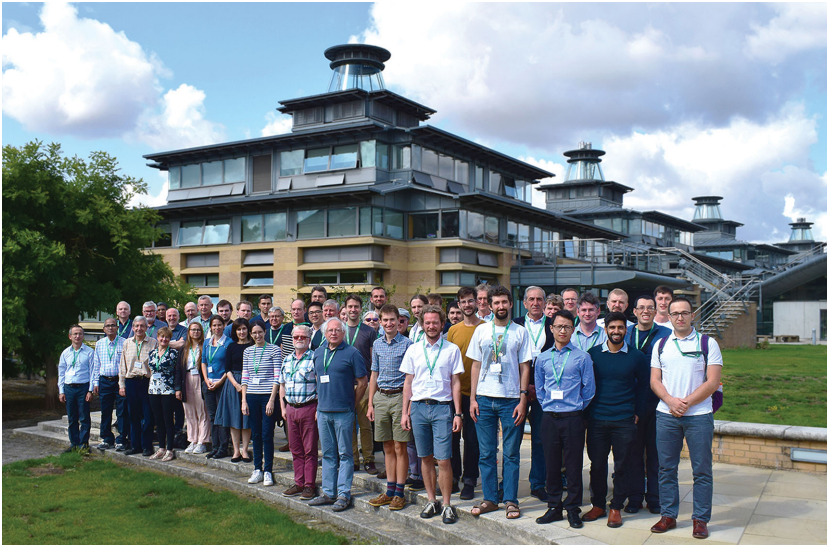
Figure 1. The participants of the WHT research programme held at the Isaac Newton Institute for Mathematical Sciences during 5–30 August 2019.