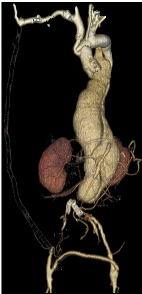
Fig 1. Preoperative computed tomography scan with volume rendered reconstruction of the extent II thoracoabdominal aortic aneurysm (TAAA).

Y-connector, allowing for two arterial perfusion systems. The wire left in place after TEVAR deployment was used to introduce a cannula to perfuse the viscera and kidneys. The second arterial perfusion system was connected to the 10-mm sidearm branch of the common iliac artery graft to perfuse the pelvis and lower extremities.