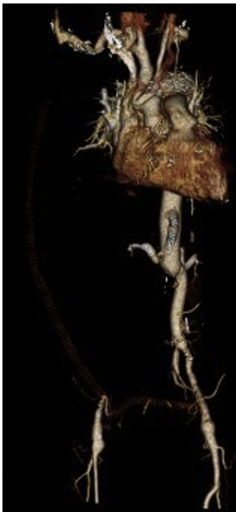
Fig 3. One-year follow-up computed tomography scan with volume rendered reconstruction of the extent II thoracoabdominal aortic aneurysm (TAAA) repair.