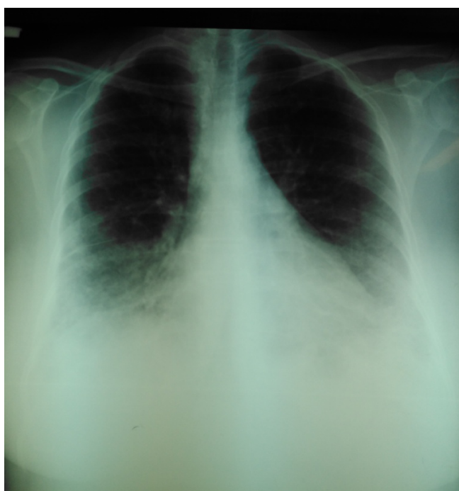
Figure 1. Chest x-rays showing increased markings in lower lung fields.

On admission, she had mild hypoxia with reduced arterial oxygen saturation (SaO 2 saturation, 90% - 92%, pO 2 65 mmHg on FiO 2 21%), and arterial blood pressure was normal. The patient had low-grade fever up to 38° C (two spikes per day). Inflammation markers were elevated (CRP 2.2 mg/dL, ESR 23mm). The rest of the basic