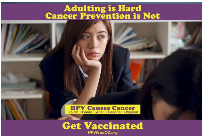
Figure 3. Boot Camp Translation product example for preteens in Metropolitan Denver, Colorado.

The group chose not to develop a tagline; instead, the group integrated messages into an infographic of photographic images and text (Figure 3). The Denver metro campaign also directed readers to the website www.HPVFreeCO.org for more information. However, the group believed it was crucial to provide key information within the messaging, so that it was delivered to readers who did not visit the website.