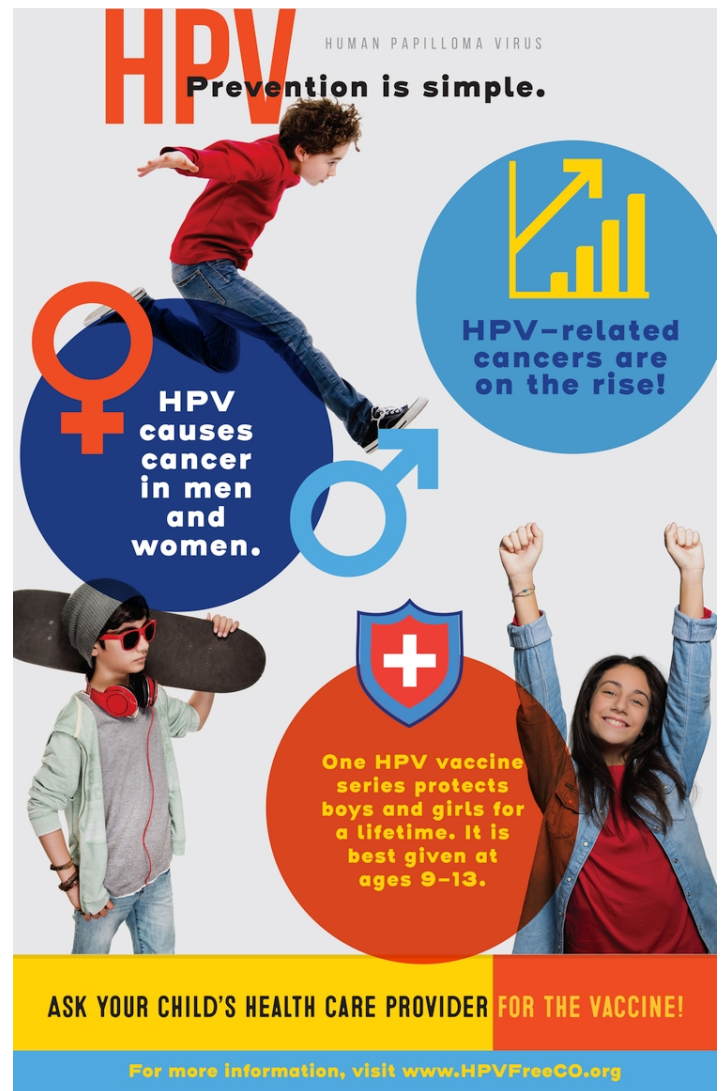
Figure 2. Boot Camp Translation product example for young adults in Mesa County, Colorado.

The group developed the tagline “Adulting is hard; cancer prevention is not,” coupled with images of young adults working, studying, or socializing (Figure 2). Other information in the messages included “HPV causes cancer: cervical, penile, vaginal, oral and anal. Get vaccinated.” Messages for parents of preteens and young adults direct readers to the website www.HPVFreeCO.org .