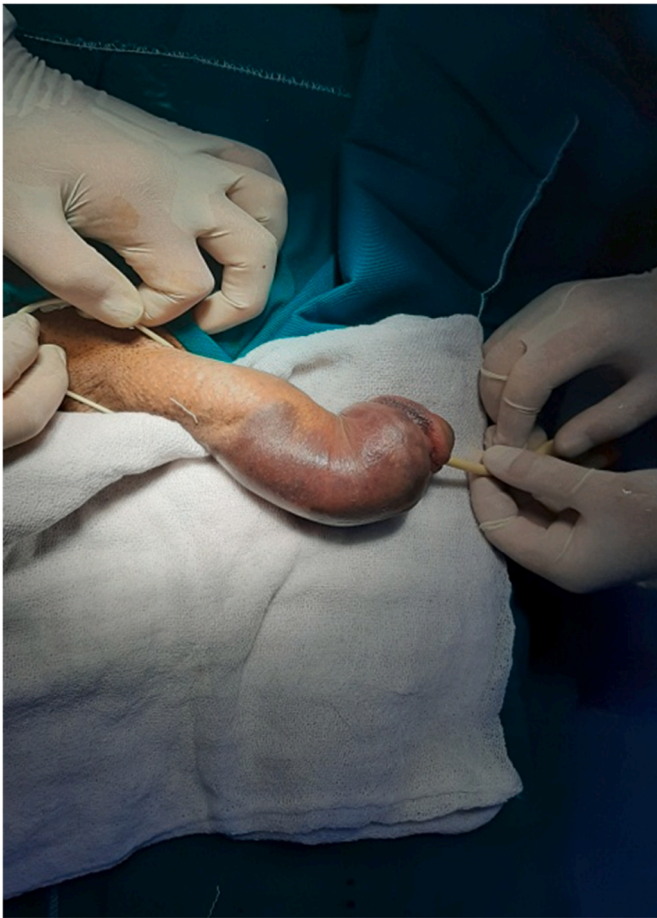
Fig. 1. Penile fracture.

(55.5%) had a penile fracture during sexual intercourse, three patients (33.3%) during masturbation and one patient (11.1%) had a penile fracture due to suddenly forced flexion (Table 2). Physical examination revealed 9 patients (100%) had penile ecchymosis, six patients (66.6%) had penile swelling, two patients (22.2%) had penile pain, eight patients (88.8%) had sudden detumescence, and six patients (66.6%) had sudden cracking noise (Table 3). Our patients were not undergone retrograde urethrography because none of them had urethral bleeding and urinary symptoms, or microscopic hematuria. The defect of the tunica albuginea was on the right side in five patients (55.5%), and four patients had it on the left side (44.4%) (see Table 4).