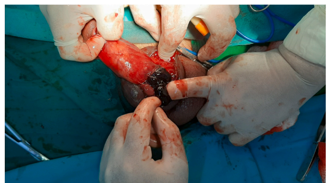
Fig. 3. Case of fracture penis showing hematoma.

In the meta-analysis conducted by Amer et al. the most common causes of penile fracture were sexual intercourse (46%), forced flexion (21%), and masturbation (18%) [7].