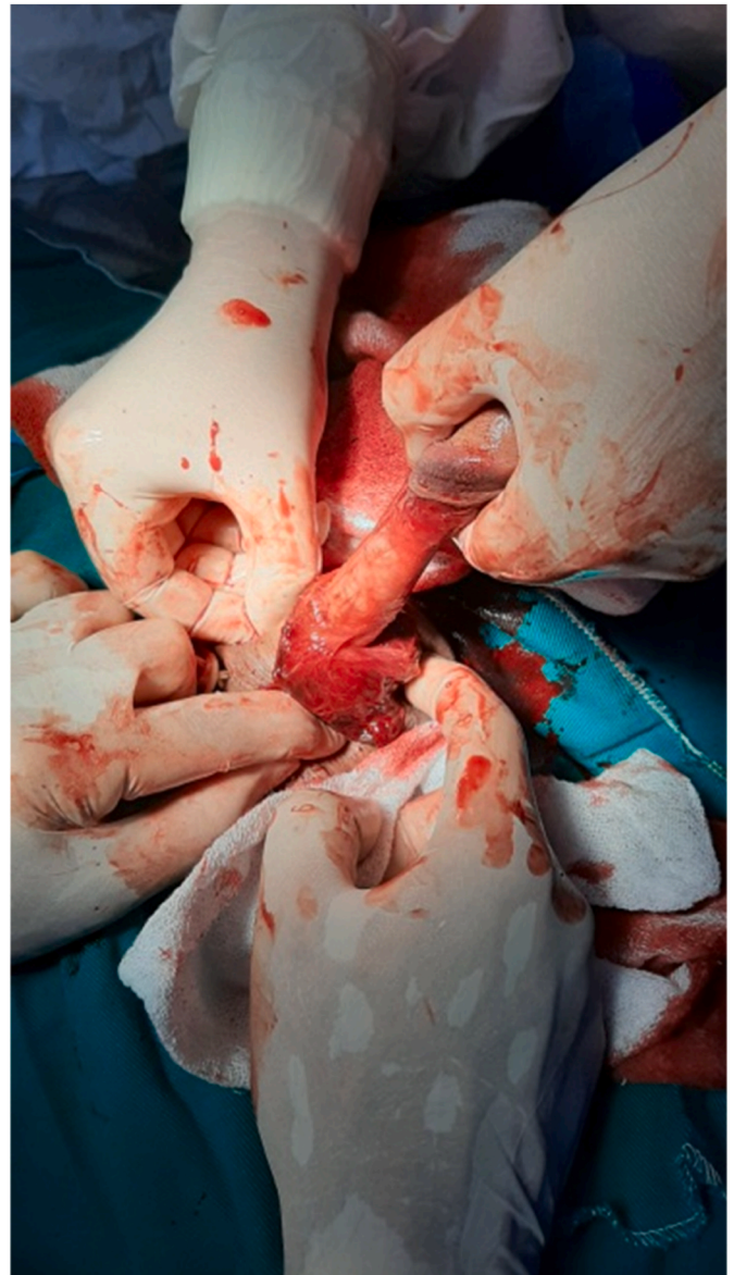
Fig. 2. Degloving incision of penis.

In our study, in line with the literature, penile fracture was observed on the right side in 55.5% of patients and proximally in 66.6%.