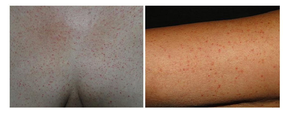
Fig. 1. Multiple 2–4-mm erythematous, blanchable macules and papules on the patient's trunk and extremities.