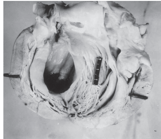
Fig. 3. Ruptured echinococcal cyst (6×4×3.5 cm in size) in the heart interventricular septum.

Other causes of sudden deaths were heart lesions (echinococcosis of the heart, pericardium). The following observations are brought as an illustration. A 51-year-old man had