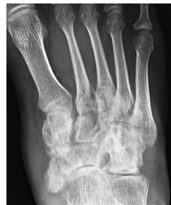
Fig. 4: Post operative radiograph of the foot showing healing of the lytic lesions.

The histo-pathological examination of the tissue revealed colonies comprising of dense tangled meshwork of slender hyphae interspersed with ovoid to round spore like structures. The colonies had brown pigmentation at the periphery (Figure 3). The fungal culture did not grow any organisms.