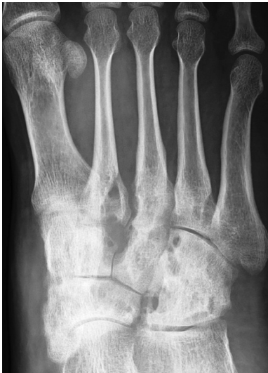
Fig. 1: Pre operative radiograph of the foot showing multiple lytic lesions involving the mid foot bones and joints.