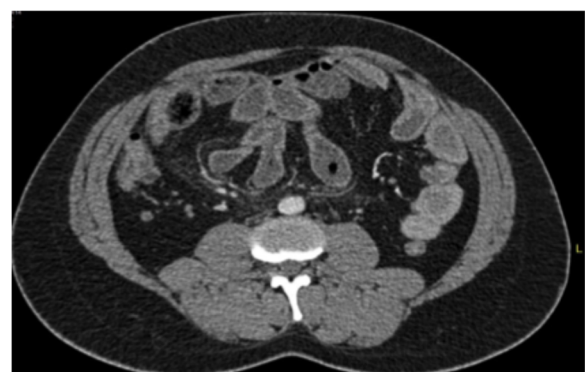
Fig. 1 Contrast-enhanced CT scan of the abdomen showing a conglomerate of multiple small-bowel loops seen in the center of the abdomen, surrounded by a thick enhanced saclike structure