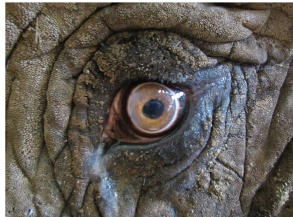
Fig. 6. After 72 hours post-operatively; a DR was intact. There was some mild perilimbal edema associated with the corneal sutures.

The causes of cataract formation include congenital defects, nutritional imbalances, oxidative damage, hereditary defects of the lens, systemic disease, age-related change, trauma and environmental effects (Kern,