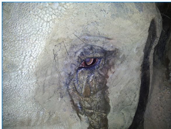
Fig. 1. Indications of ocular discomfort included epiphora and increased blink rate.

Ophthalmic examination was performed in the conscious patient by an RCVS boarded Specialist in Veterinary Ophthalmology (JC). The patient was already trained to walk forward to the perimeter wire of the enclosure and lower her head so that her eye was at standing eye height for the examiner. From here, personnel were able to approach her from outside the wire and perform the examination (Fig. 2). She was also trained to tilt her head to make the application of topical medication easier. The eye was examined using a slit-lamp biomicroscope (Keeler PSL Classic; Keeler Ltd, Windsor, UK) and direct ophthalmoscope (Keeler Practitioner direct ophthalmoscope; Keeler Ltd, Windsor, UK). Neuro-ophthalmic assessment revealed an absent menace response, with an intact dazzle reflex (DR) and direct pupillary light reflex (PLR). Ocular examination revealed a serious ocular discharge and conjunctival hyperemia. The cornea was clear and healthy, with no opacities or defects, and there was no fluorescein uptake. There was no aqueous flare present or indication of anterior segment inflammation. The pupil was round and mid-size, and there was anterior and posterior subcapsular cataract formation with cortical extensions (Fig. 3). Posterior segment examination was