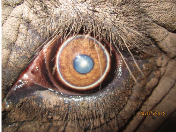
Fig. 3. Photograph of the eye taken prior to surgery. Note the conjunctival hyperaemia and late-immature cataract formation. Cornea appears to be healthy.