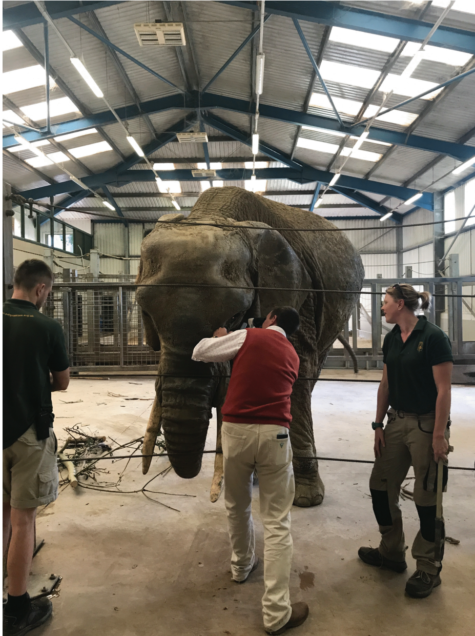
Fig. 2. The patient was managed using “protected contact” and was examined from the other side of a barrier fence.

Hartmann’s solution throughout the procedure. Anesthetic monitoring included pulse oximetry, electrocardiography, and capnography. Intravenous marbofloxacin 2 mg/kg (Forcyl; Vetoquinol, UK) was administered perioperatively. At the end of surgery, all monitoring equipment was removed and the patient extubated. To antagonize the etorphine 1 mg diprenorphine (Revivon; C-Veterinary Products, Leyland, UK) was administered subcutaneously and a further 12.3 mg intravenously, after which the remaining intravenous catheter was removed. Between extubation and standing, oxygen was administered via